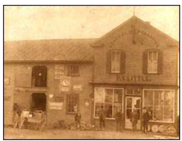
Early photo of the P.T. Little General Merchandise Store