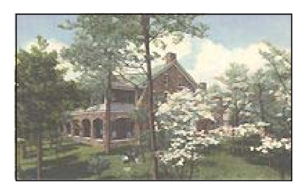
Early postcard of the Woodmont Rod & Gun Club now owned by the State of Maryland