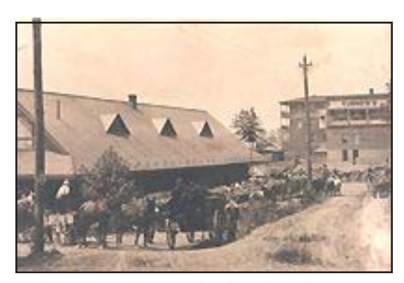
The Western Maryland Railroad Station - Now at the location of the Rail Trail Parking Area