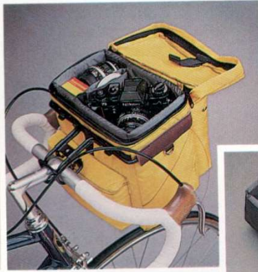
Camera Carrier pictured in S/T ELITE HANDLEBAR BAG.

After reflectors, a rear view mirror is perhaps the most functional safety equipment a bicyclist can use. Small and lightweight, these mirrors provide extraordinary rear vision without having to turn around. The mirror comes in three models designed for: 1) glasses with wide temples; 2) glasses with wire temples; and 3) cycling helmets.