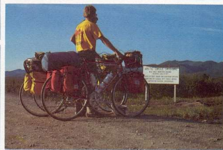
Arctic Circle, the Yukon.

KIRTLAND/TOURPAK is inspired by individuals such as the Hartshorns: adventurers willing to take the challenges and benefit from the varied experiences that await all touring cyclists.