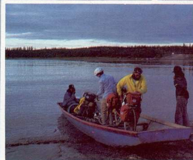
Northwest Territories, Canada.