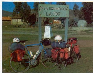
The Equator, Equador.