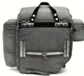
C. Suspension system in normal position.