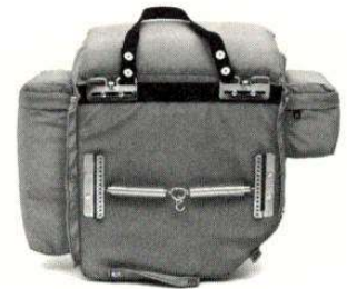
D. Springs moved up for greater tension.