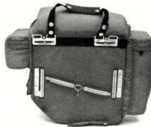
E. Suspension system adjusted in one of many other possible positions.