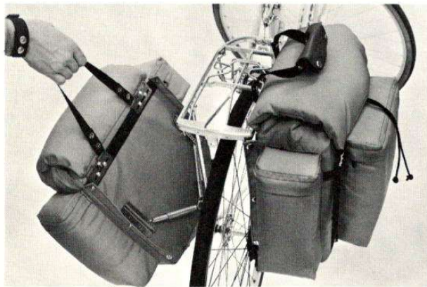
B. Mounting of the pannier. DM-6