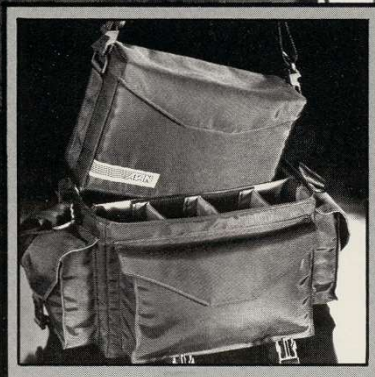
Model S68 II with S18 II Module pullout case